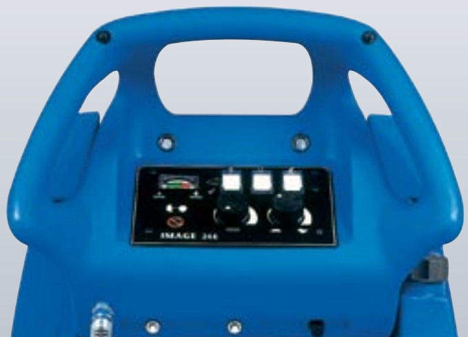
Ergonomic handle is designed for convenient multi-positioning and easy operation.