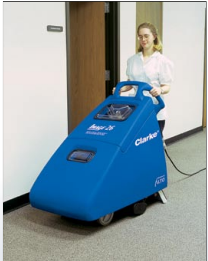
Wash & Rinse® - "We Do Carpets"